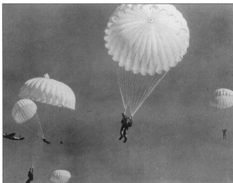
Parachutes reduce the risk of injury after gravitational challenge, but their effectiveness has not been proved with randomised controlled trials